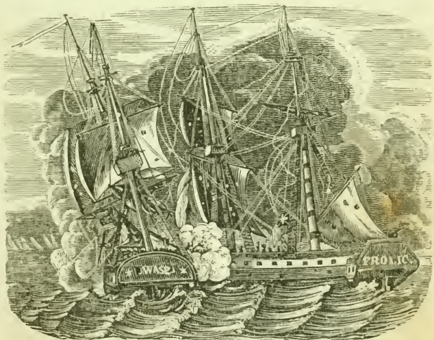
BATTLE OF THE WASP AND FROLIC.....COMMODORE JONES.